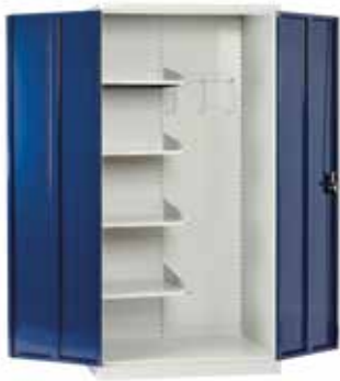
janitor cupboard Premium utility cupboard with 4 half-width adjustable shelves and hooks UTC3