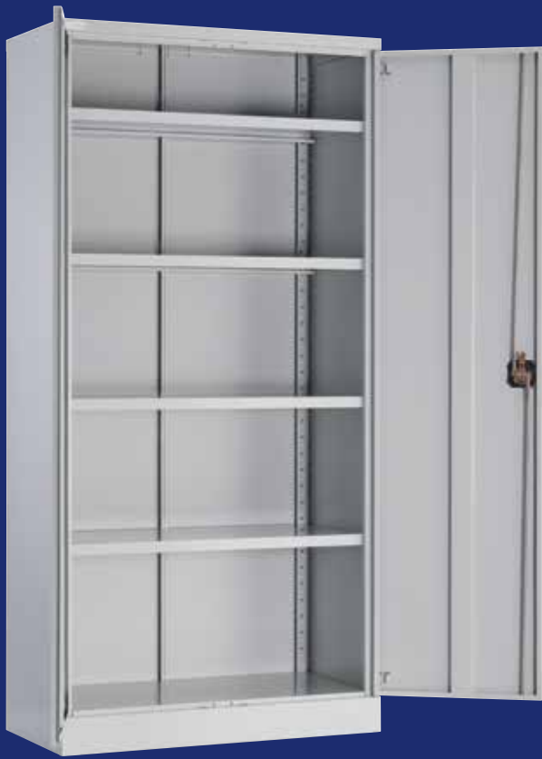
swing door cupboards High Cupboard with 4 Shelves QFSMC3