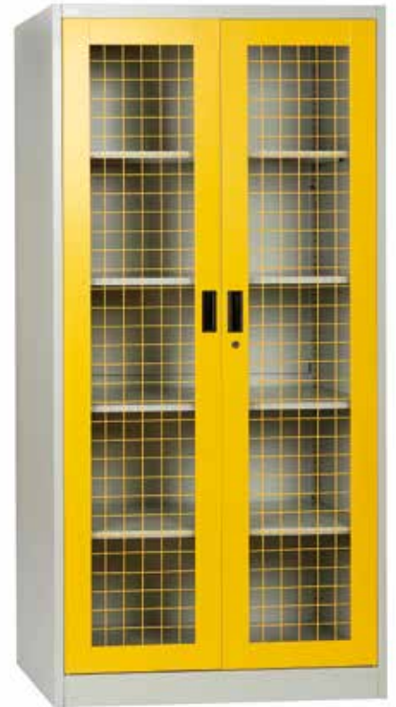
mesh door cupboard QFSMDC