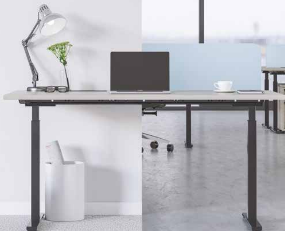
b-active sit-stand desks