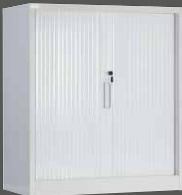
side opening tambour TDM A