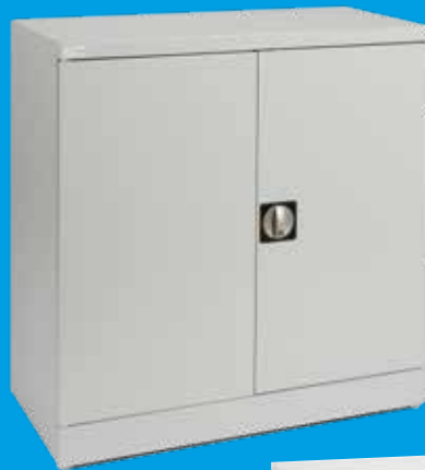
swing door cupboards Assembled Half Height Cupboard c/w 1 Shelf QFSMCA